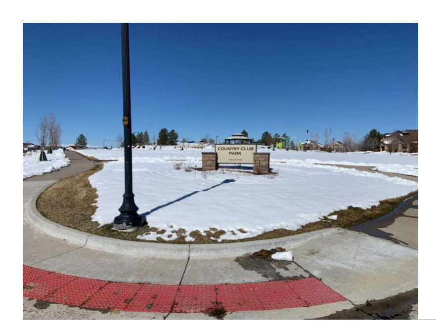
Item 1 View of Country Club Park as of 3/18/24.