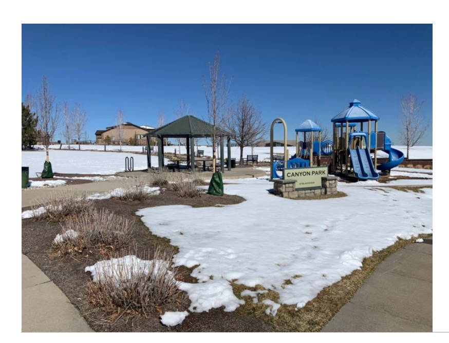
Item 3 View of Canyon Park as of 3/18/24.