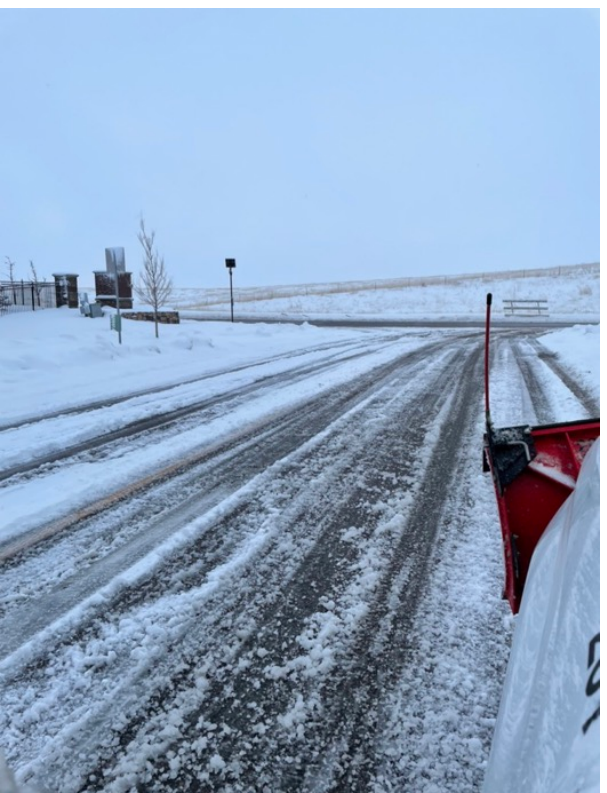
Item 10 View of the entrance near the Hilltop Park from Friday morning.