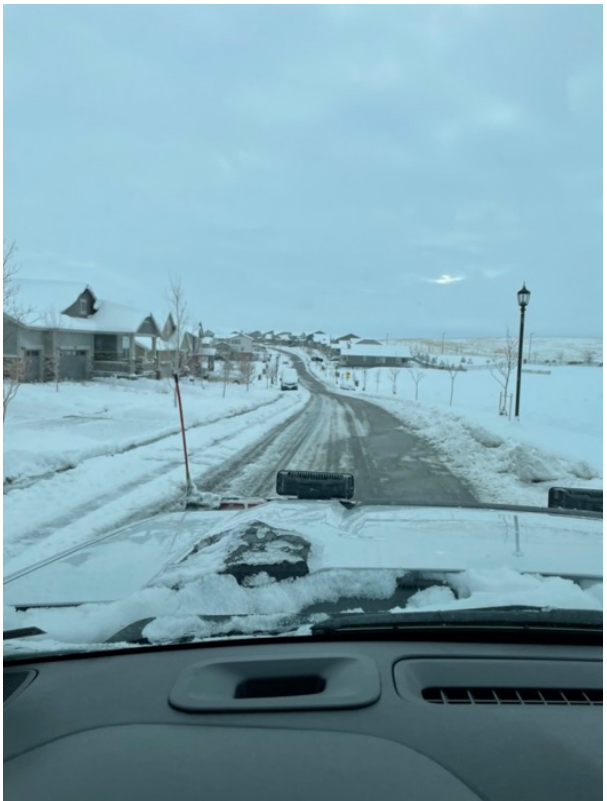
Item 14 View of Alder drive on Friday morning.