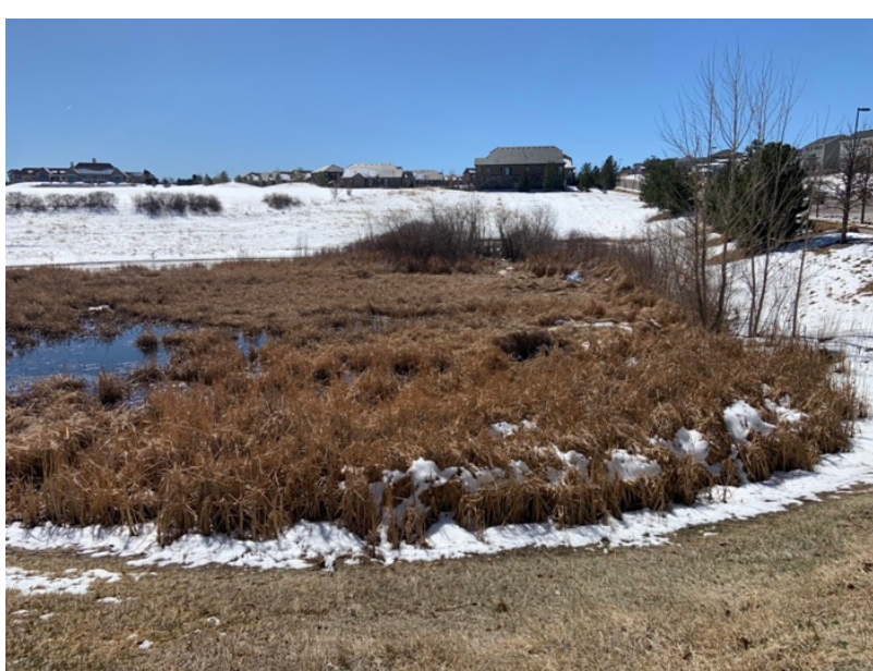
Item 8 Another view of the previous item.

Northern detention pond. We check the screen multiple times a week to remove the blockage so the water can keep draining. We have work in this pond as well that we will do in April, but we will need all the water drained to perform our work.