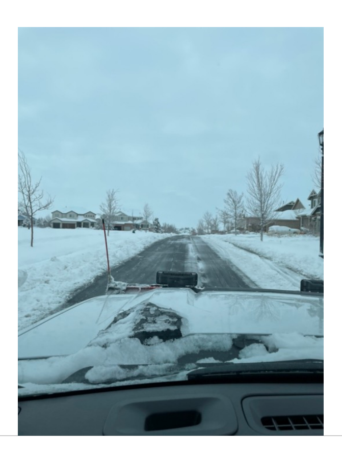
Item 13 Side roads near Country Club Park as 8:15 am Friday.