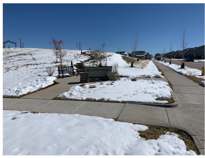
Item 2 View of Hilltop Park as of 3/18/24.