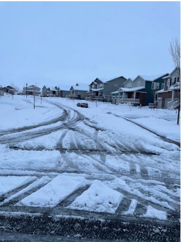
Item 12 Side roads by the Monaghan entrance before any plowing.