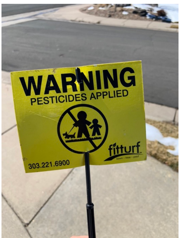
Item 4 Pre-emergent weed application flags.