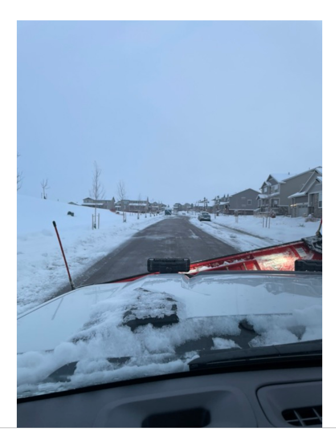
Item 9 View of Hilltop Park as of 7:30 am on Friday, the day after the storm.