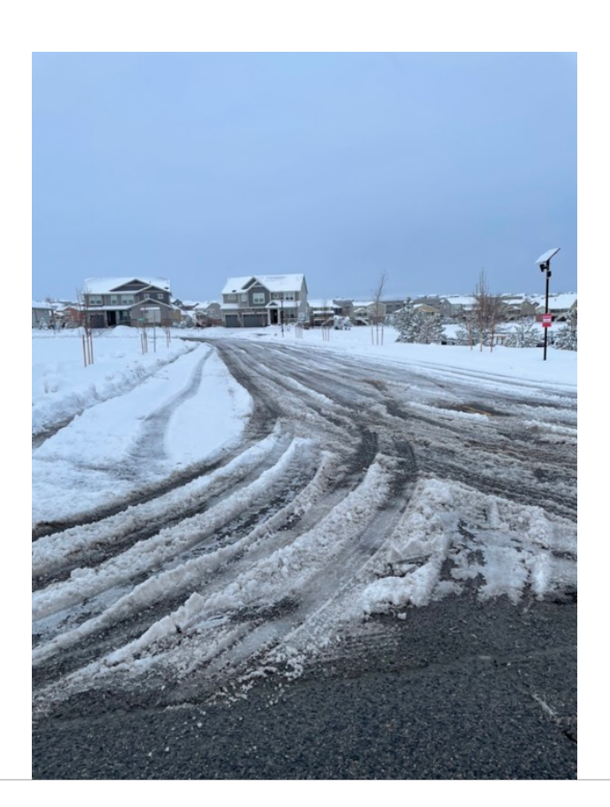
Item 11 Monaghan entrance view on Friday morning.