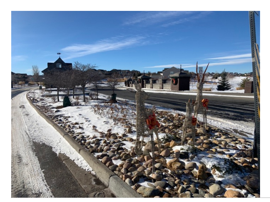
Item 1 Holiday decor will be removed and stored