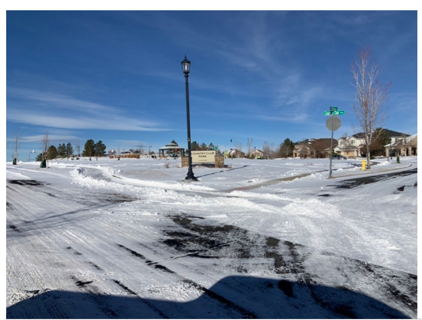
Item 6 Country Club Park view as of 1.9.2024.