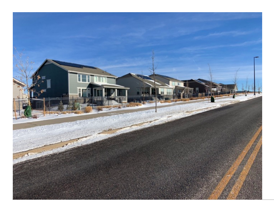
Item 3 Additional grasses that have already been cut