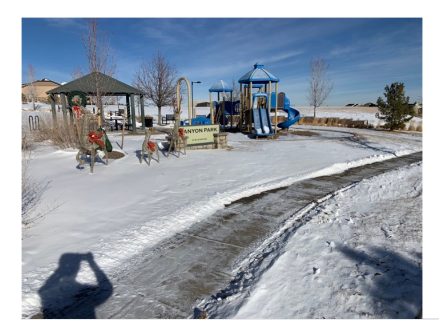
Item 5 Canyon Park view on 1.9.2024