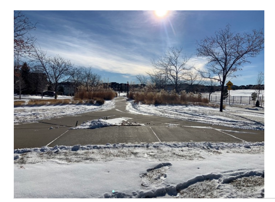
Item 9 Mineral median looking east.