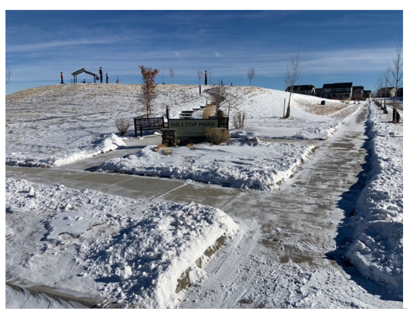
Item 4 Hilltop Park after snow removal. Photo taken on 1.9.2024.